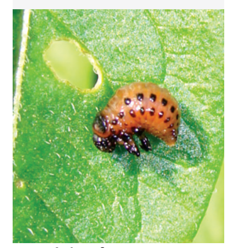
1 day after treatment Torac @ 21 fl oz/acre