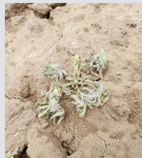
Liberty 280 SL 43 fl oz/A + ETX 1.25 fl oz/A

* All treatments included 1% COC Dr. Wayne Keeling, TAMU, Lubbock, TX, 2020