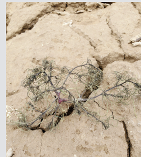
Liberty 280 SL 43 fl oz/A + ETX 1.25 fl oz/A