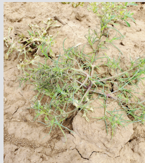
Liberty 280 SL 43 fl oz/A