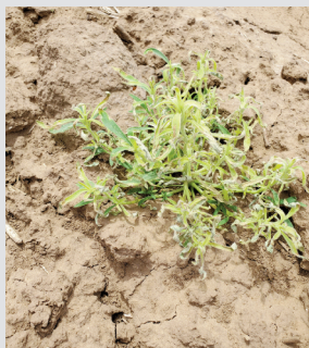
Liberty 280 SL 43 fl oz/A