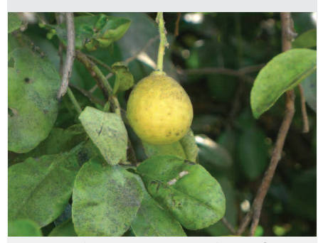
Black Sooty Mold on Grapefruit